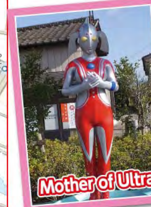
Mother of Ultra